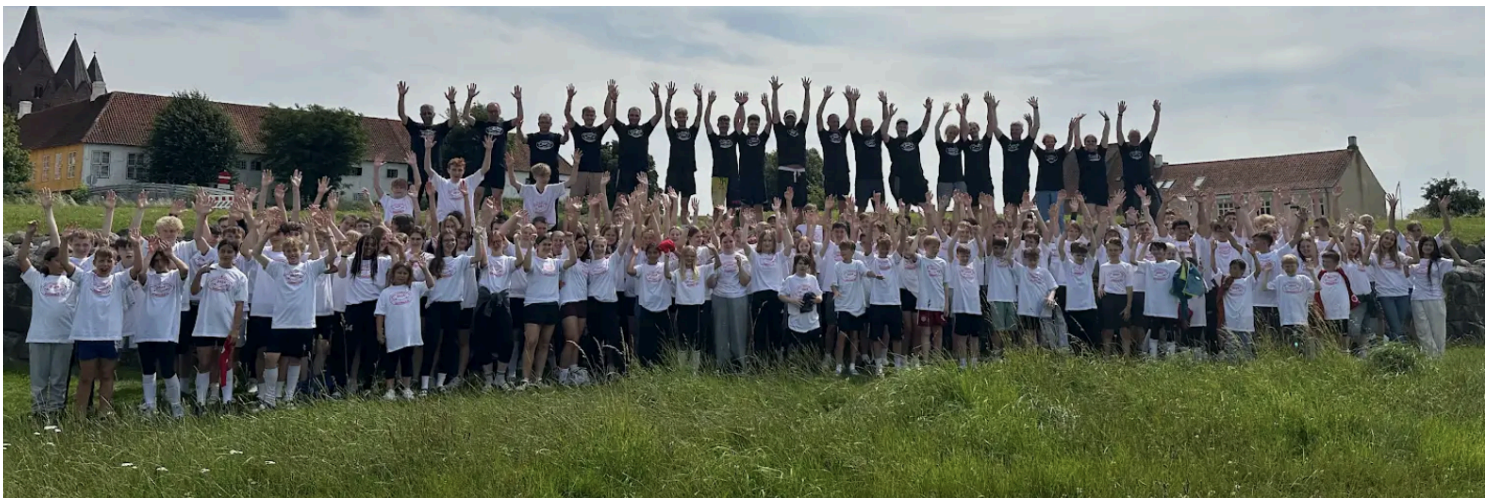
Participants, coaches, helpers and camp leaders at DFF's Summercamp 2024

All fencers born in or before 2016 are invited to take part in the camp